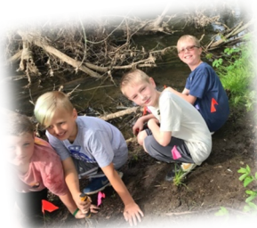
SPARTA EDUCATION FOUNDATION DONATIONS JULY 1, 2021-JUNE 30, 2022