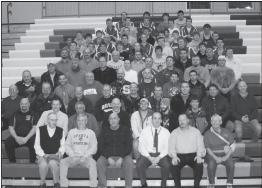
The evening ended with a picture taken of all past and present Spartan wrestlers.

One potential change we are examining is our bussing schedule. The single bus run has served the original purpose of reducing transportation cost the past six years. A draw back of the system is the start and end times for all buildings are dictated by a common transfer site in the morning and afternoon. Since buildings start and end times are relatively the same traffic congestion is intensified around all buildings both times of the day. If we can come up with a plan to stagger the schedules of the secondary and elementary buildings it would result in a much better flow of traffic throughout the district. The challenge is to be cost effective and beneficial to the educational needs of our students. We are continuing to look at options which will reduce the frustration of school traffic.